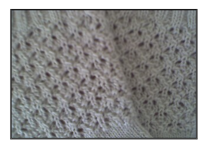
English Mesh Lace (multiple of 6 sts in the round)

Rnd 1: *yo, ssk, k1, k2tog, yo, k1*, repeat from * to *